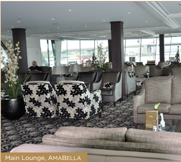
Main Lounge, AMABELLA

Rebuilt in 2021, the AmaVerde and AmaBella's unique custom design, multiple dining venues and exclusive amenities make these ships unlike any other on the world's greatest waterways. The 160-passenger ships feature our signature "Twin Balcony" staterooms and suites, each with a French Balcony for unimpeded views and fresh air, plus a separate step out balcony for private enjoyment.