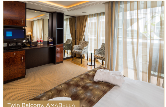
Twin Balcony, AMABELLA